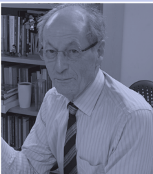
Sir Michael Marmot Professor of Epidemiology, University College London