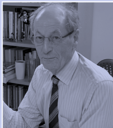
Sir Michael Marmot Professor of Epidemiology, University College London